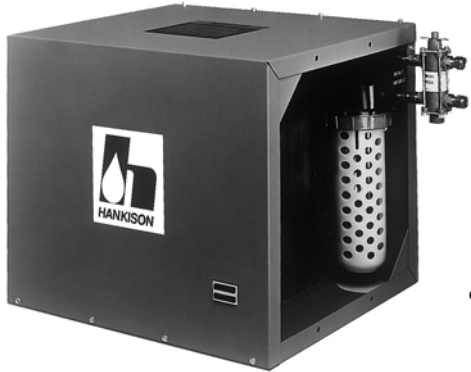
Dryer shown with optional bypass valve

Today's "mini" style pneumatic thermostats have smaller orifices and ports. To ensure long life, check the capacity of your air dryer system. Your discharge air temperature should not exceed 40°F. By installing the correctly-sized air dryer you will greatly reduce the need to service a moisture-contaminated system