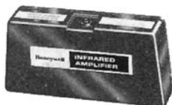
R7247B,C; R7248A,B; R7473A

Call with your model number to be replaced and we will select a programmer, amplifier, adapter subbase and detector. Your order will have complete replacement instructions.